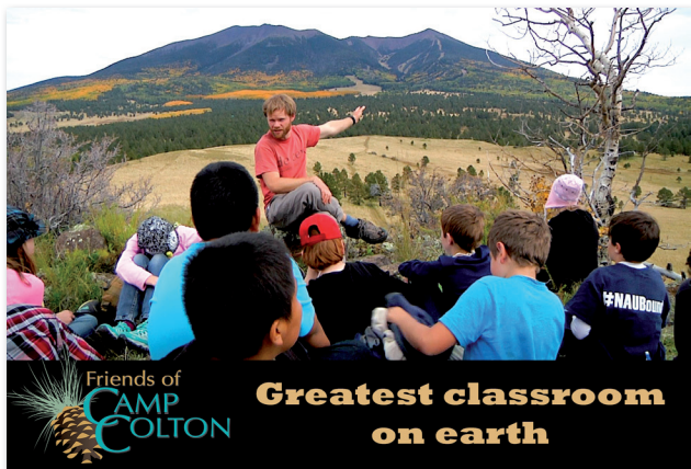
Friends of Camp Colton (FCC)