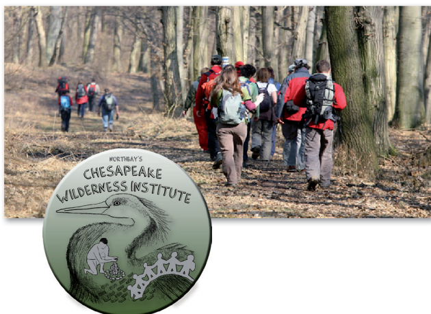
Chesapeake Wilderness Institute (CWI)